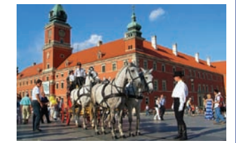
interesting buildings and monuments (the service costs a bit more in case of guidance in foreign languages).

In the summer it is nice to have a ride around the Old Town in one of the carriages waiting at the Castle Square, alternatively you can take a horse tram called "omnibus", which has its stop at the Castle Square. Such an omnibus tour takes less than an hour (for more details see: www.ztm.waw.pl ). A great attraction for children is the Old Town train which also departs from the Castle Square. During a 30-minute ride the guide tells you about